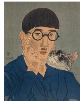
Fougita (or Fujita Tsuguharu) (Japanese, 1886 - 1968) Self-Portrait, c. late 1930s Los Angeles County Museum of Art