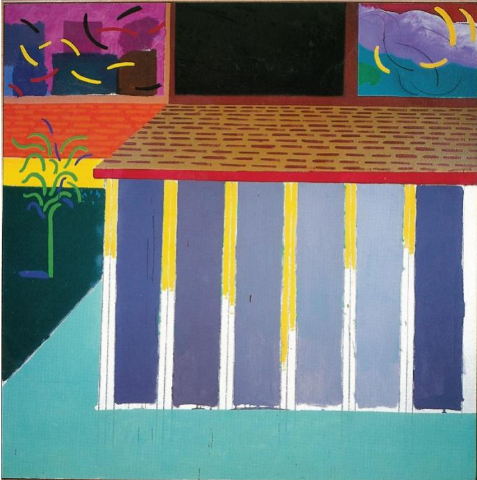
David Hockney (British, b. 1937) "Japanese House and Tree," 1978 Acrylic on canvas, 72 x 72 in. Roy B. and Edith J. Simpson Collection © David Hockney