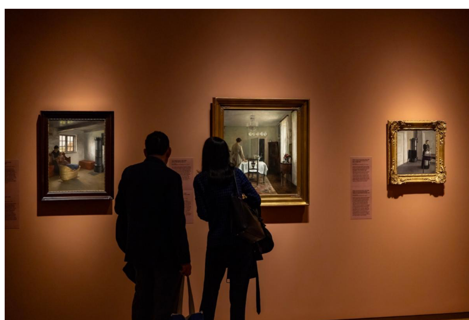
The Art of Work: Painting Labor in Nineteenth-Century Denmark member opening.