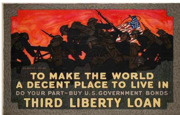
5_Paus_To Make the World

Gordon Grant (American, 1875-1962) Will You Supply Eyes for the Navy? c. 1917-18 Print, 29 x 20 1/2 in. Gift of John and Beverly Watling, Bruce Museum Collection 2008.03.22