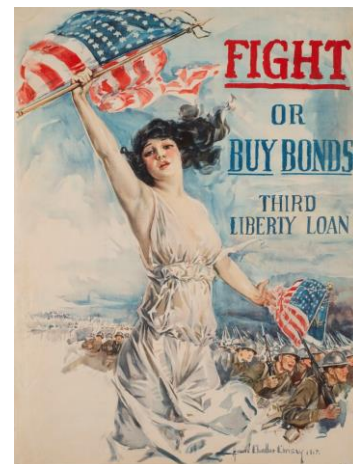
6_Christy_Fight or Buy

Herbert Andrew Paus (American, 1880-1946) To Make the World a Decent Place to Live In , 1918 Lithograph, 35 x 56 1/2 in. Gift of John and Beverly Watling, Bruce Museum Collection 2008.03.31