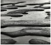
From Butterflies to Battleships: Selections from the Bruce Museum Photography Collection