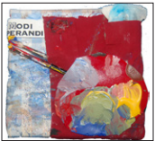
Your Place Squared: Community Art Project