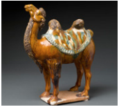
Buried Treasures of the Silk Road